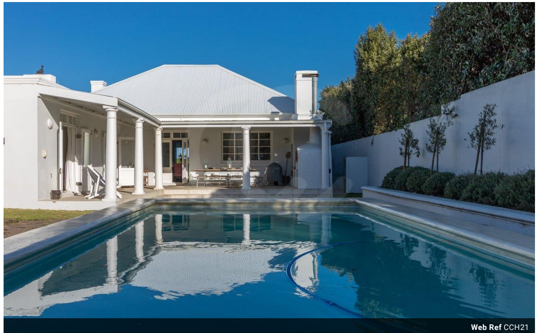
Web Ref CCH21