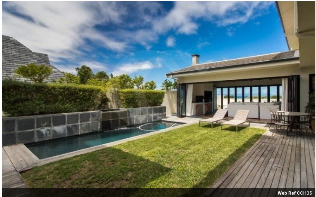
Web Ref CCH35